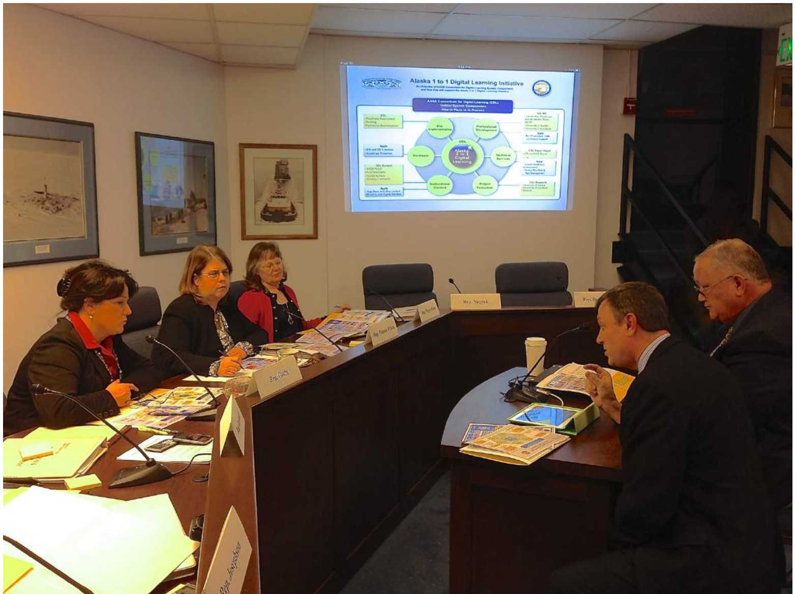
Legislative Committee testimony