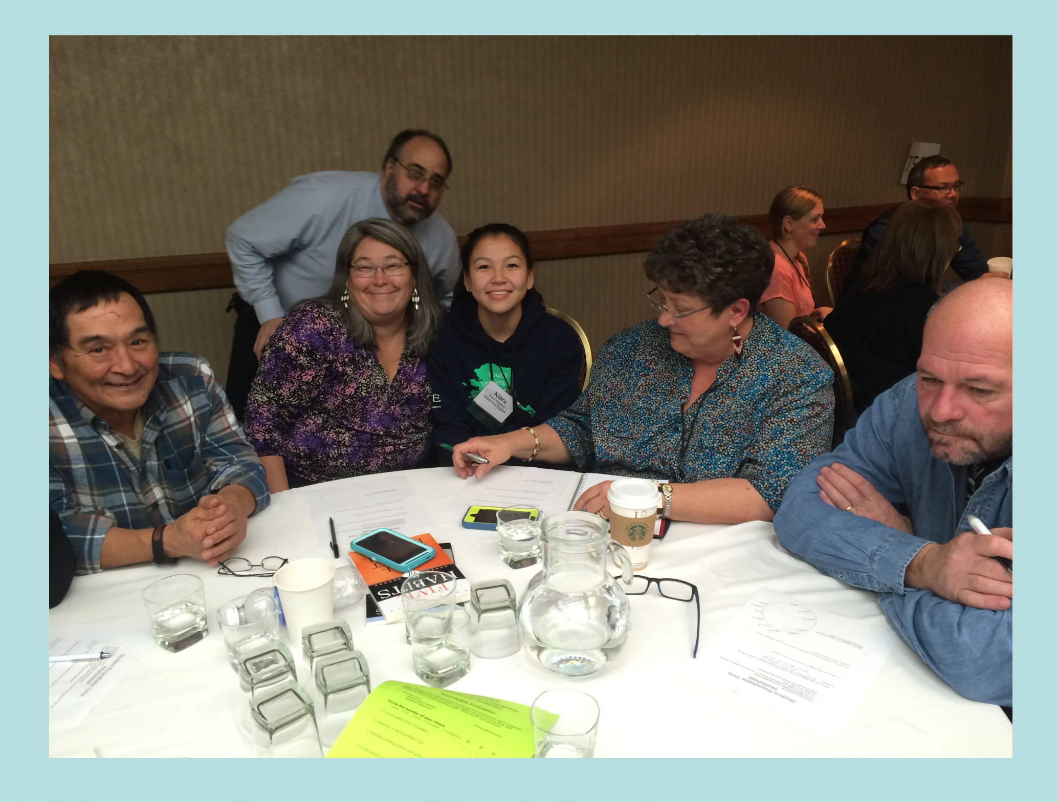
Why do a Self Assessment?