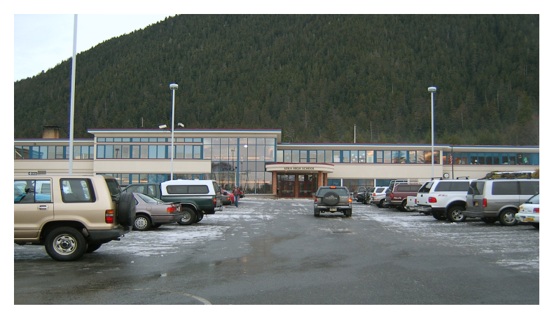
Sitka High School

With a current enrollment of approximately 1,107 students, the Sitka School District operates six schools, including an alternative high school (Pacific High) and a district-supported homeschool program. Sitka Schools have consistently ranked above average for schools in Alaska in academic proficiency. Keet Gooshi Heen Elementary School was one of three Alaska schools in 2023 to be named a National Blue Ribbon School. Still, evidence suggests that significant gaps exist in academic ability between various student demographics. The school board and staff have strategically worked to improve student outcomes by creating more culturally responsive schools and instruction, implementing social-emotional learning frameworks, and developing closer relationships and collaboration with Sitka's Alaska Native communities (Sitka Tribe, Alaska Native Brotherhood/Alaska Native Sisterhood). This work continues to be a focus for the district.