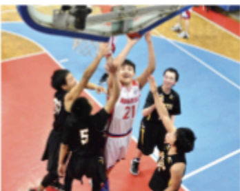
Basketball is extremely popular in LKSD schools and communities.