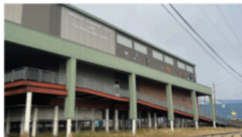
Amaqigciq Elementary and Chaputnguak High School in Chefnak.