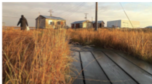
Getting around the village on the boardwalk.