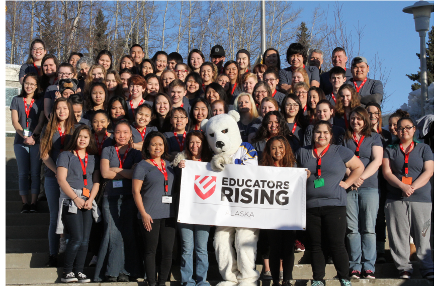
Students from all over Alaska at UAF in March, 2018

Students will compete in Educators Rising national competitions and have the chance to place to go on to nationals.