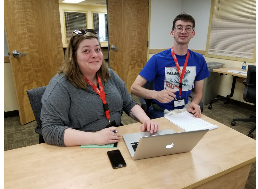
Teachers from Nome and Chevak at the May, 2018 professional development workshop

Professional development offered at least once, often twice a year as demand warrants.