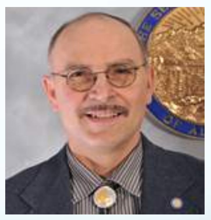
Sen. Click Bishop, R-Fairbanks