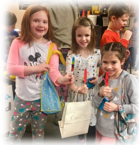
Pictured to the left are elementary students enjoying the 100 th day of school fun on January 31 st .